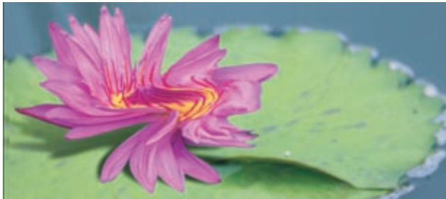
An image after a fluid effect is applied