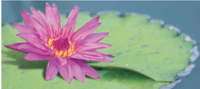
An image before a fluid effect is applied

For information about brush settings, see “Setting the brush size and velocity.”